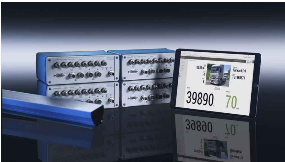
Image 2: Kistler's new WIM solution KiTraffic Plus can measure vehicle loads at different speeds and on a virtually infinite number of lanes.